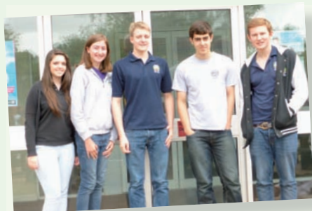
The Winning Team