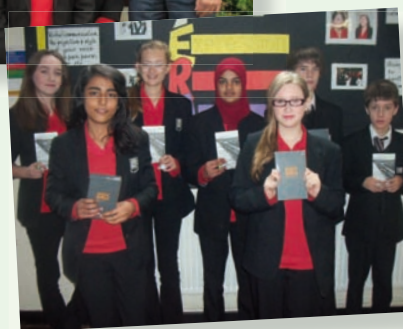
Year 9 students with their runners up prizes