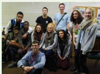
Some of the Year 12 Religion and Philosophy students with the Israeli Delegates