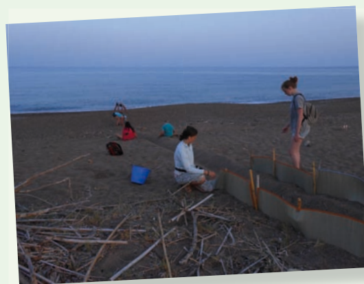
Helping the hatchlings get to sea